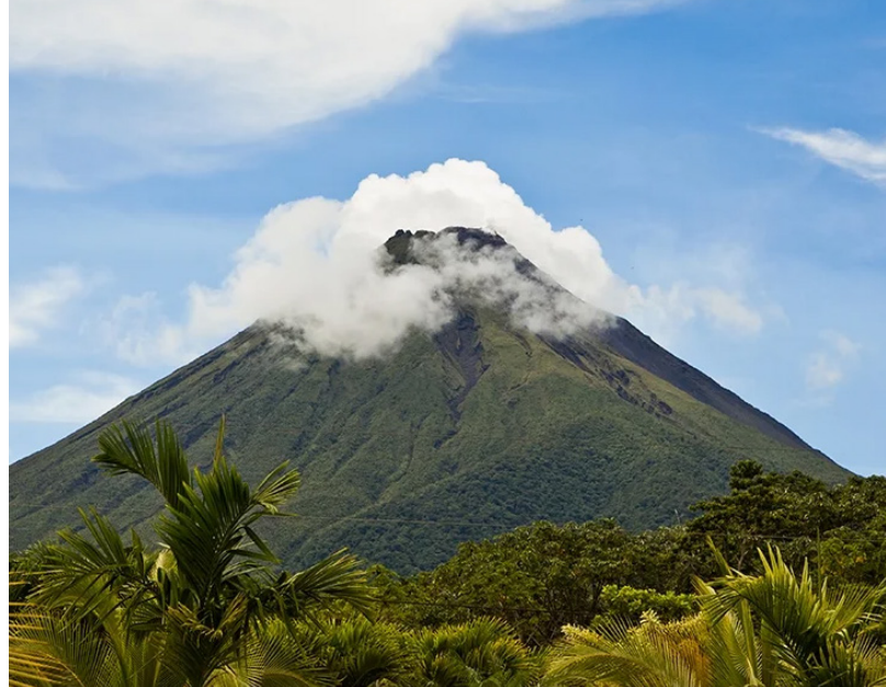
Left photo: Tortuguero National Park / Right photo: Arenal Volcano