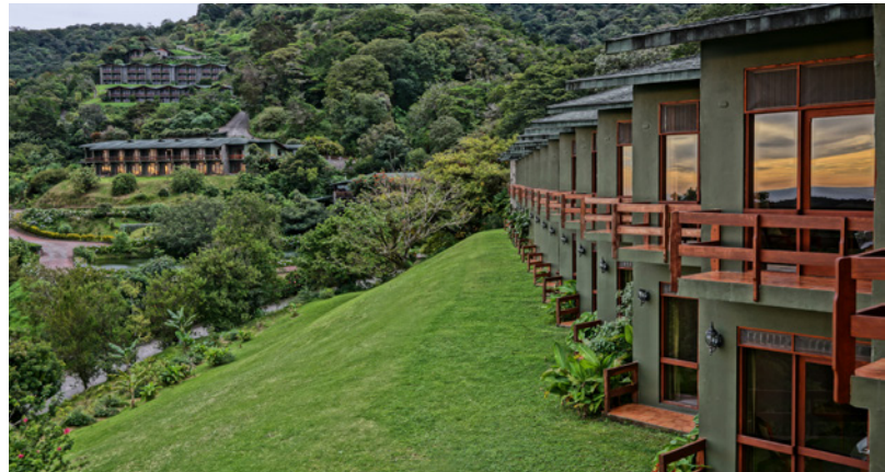
El Establo Monteverde