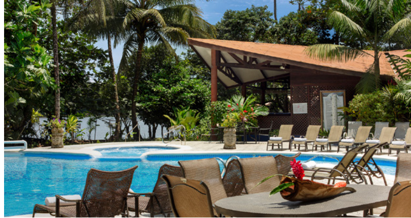
Aninga Lodge, Tortuguero