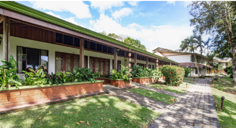
Tilajari Hotel, Arenal