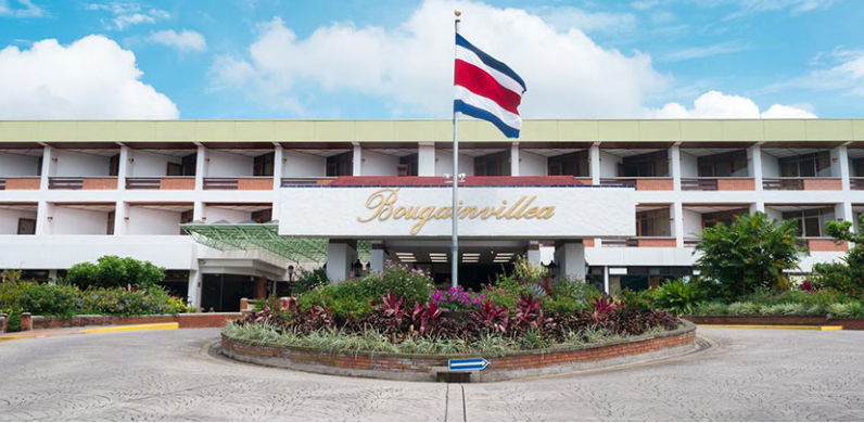
Bougainvillea Hotel, San Jose