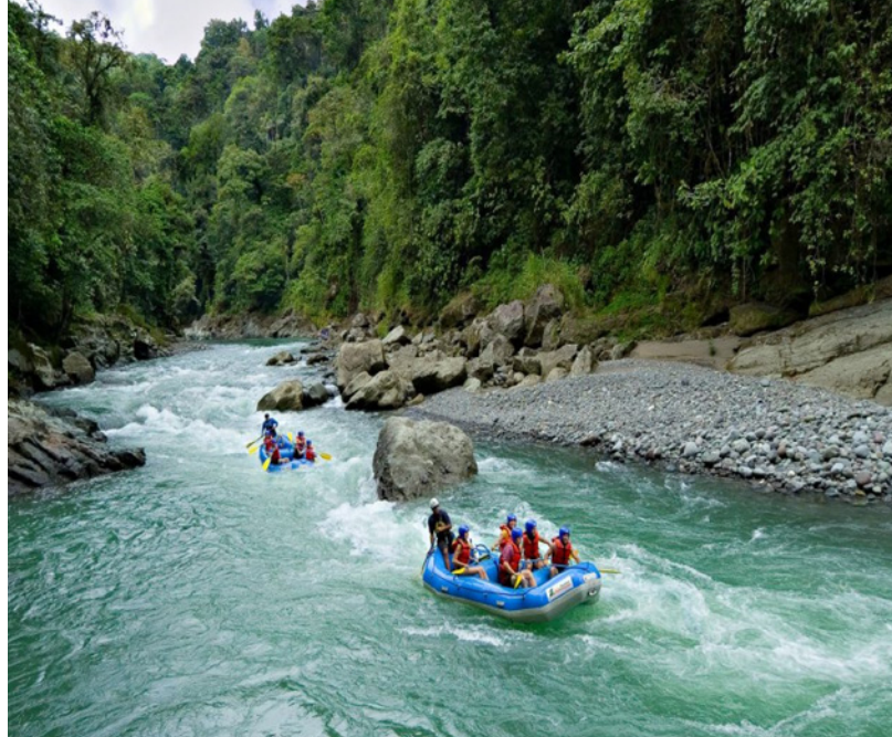
Right photo: Sarapiquí River rapids