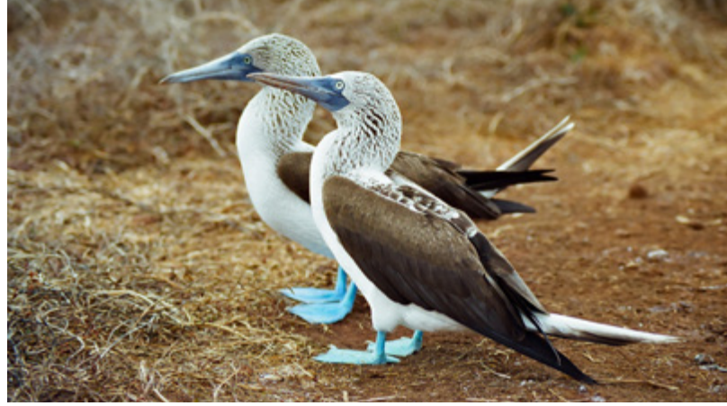
A curious marine iguana; Courting Blue-footed Boobies