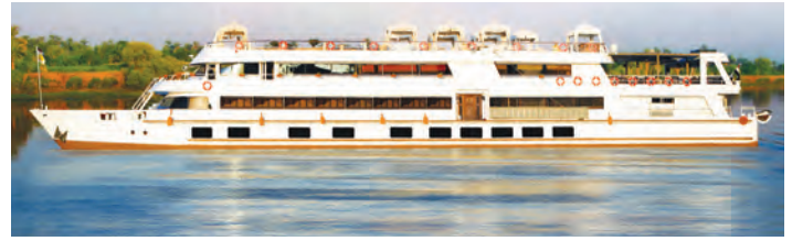
Sanctuary Nile Adventurer

This five-star hotel features three tennis courts, a hot tub, and three swimming pools surrounded by a landscaped garden. All rooms feature decorative touches highlighting Egypt's illustrious heritage. Double rooms with an extra bed ( triple occupancy ) are available.