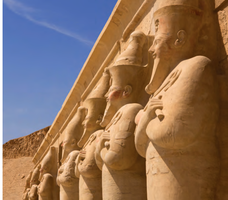
Temple of Philae, Aswan (left); Luxor (right); and the Temple of Queen Hatshepsut at Deir el-Bahari (below)