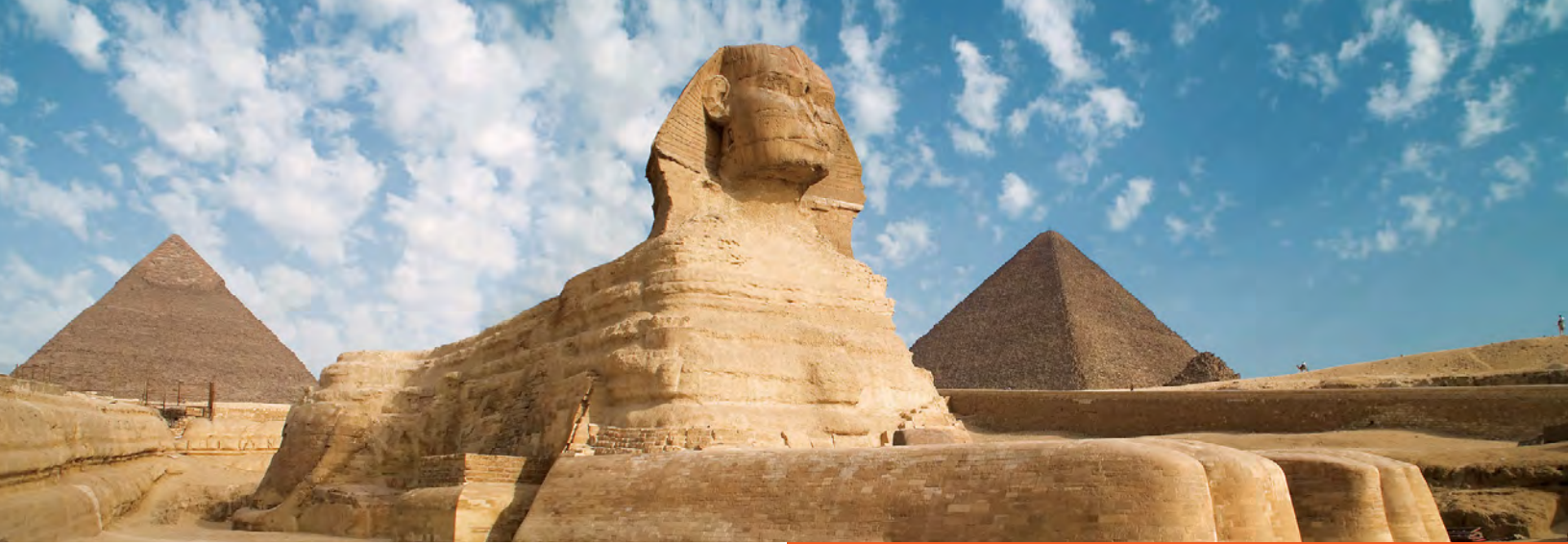
Great Pyramids, Giza (top) and Relief, Temple of Ramesses II, Abu Simbel (below)