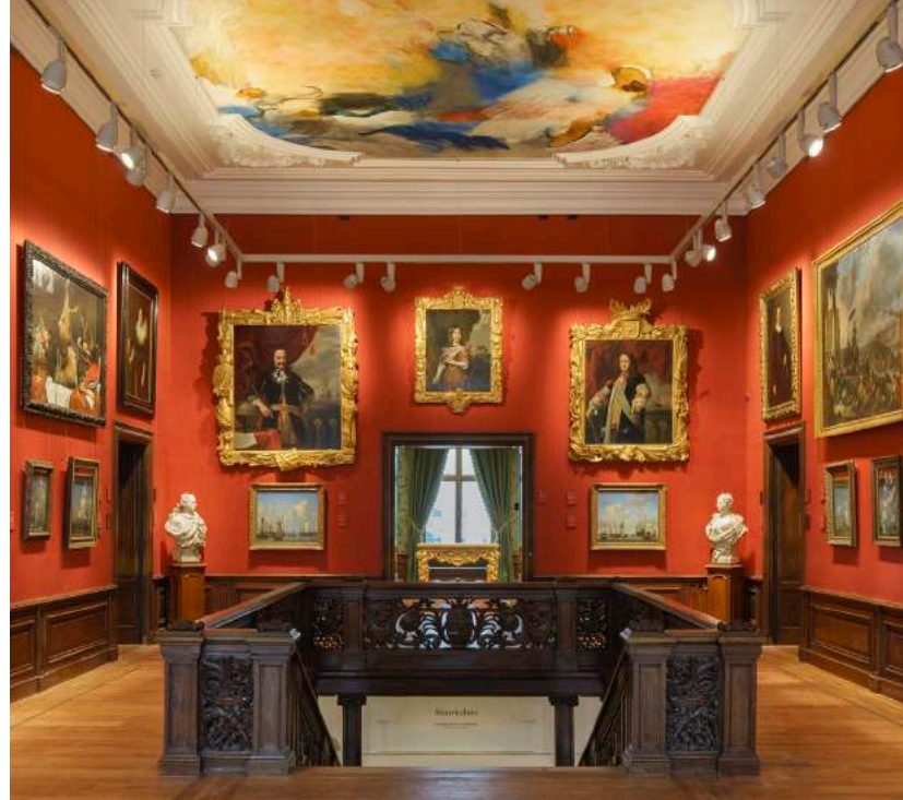
Map of the region (left); Mauritshuis, The Hague (right); and Les Falaises d'Étretat, France (below)