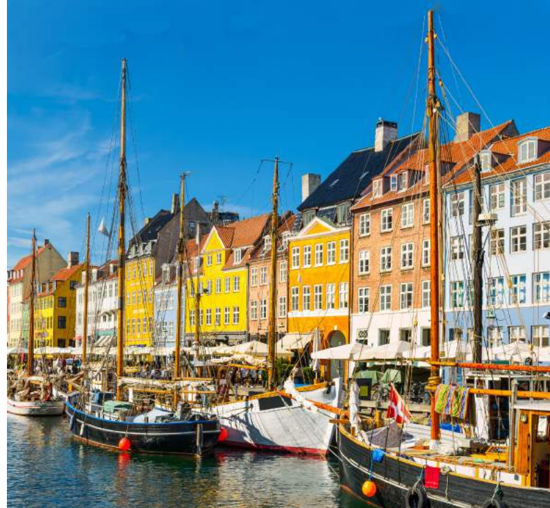
Holstentor, Lübeck, Germany (left) and Copenhagen, Denmark (right)

contrast, tour the Groninger Museum, a futuristic structure showcasing modern and contemporary art. After lunch, learn about traditional printmaking at the GRID Grafisch Museum Groningen, where you will attend a specially arranged graphics art workshop. Garden lovers may choose to visit Hortus Haren, one of Holland's oldest botanical gardens, and the Museum De Buitenplaats, a botanical complex with flowery garden roofs. B,L,D